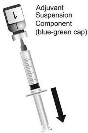
Figure 1. Cleanse both vial stoppers. Using a sterile needle and sterile syringe, withdraw the entire contents of the vial containing the adjuvant suspension component by slightly tilting the vial (blue-green cap). Vial 1 of 2.

products should be inspected visually for particulate matter and discoloration prior to administration, whenever solution and container permit. If either of these conditions exists, the vaccine should not be administered.