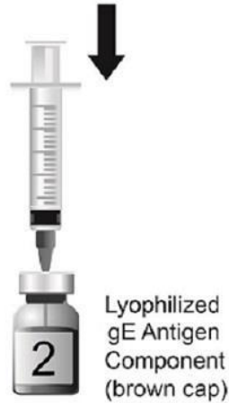
Figure 2. Slowly transfer entire contents of syringe into the lyophilized gE antigen component vial (brown cap). Vial 2 of 2.