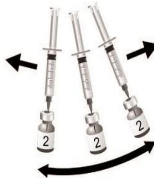
Figure 3. Gently shake the vial to thoroughly mix contents until powder is completely dissolved.