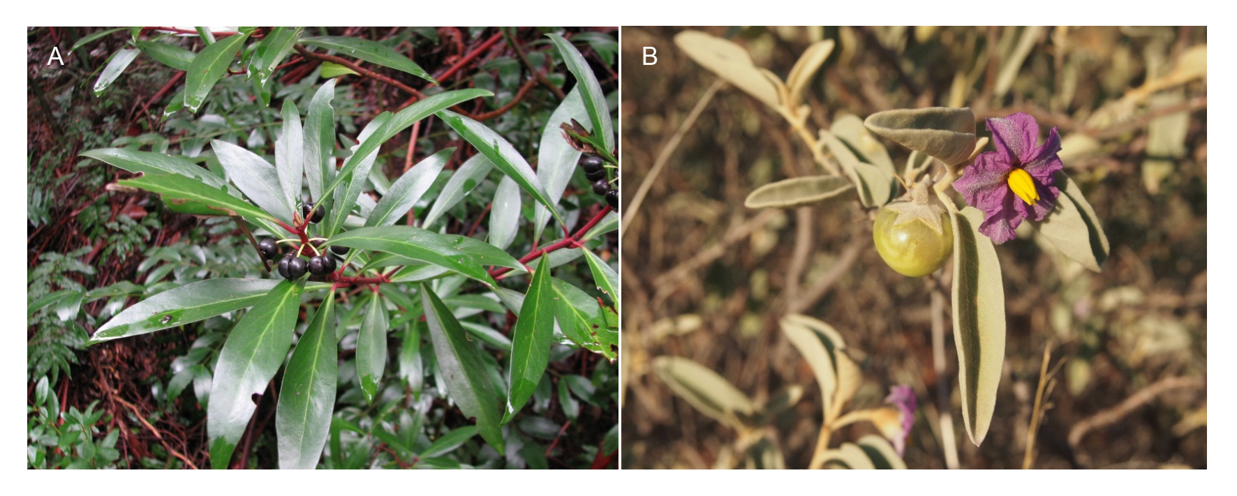
Figure 2. ( A ) Tasmannia lanceolata (Tasmanian pepper); ( B ) Solanum centrale (bush tomato).