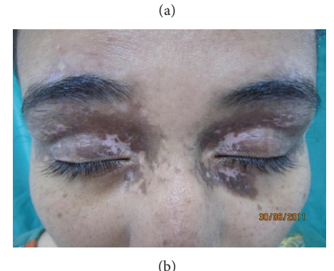
FIGURE 2: Patient of vitiligo treated with NBUVB phototherapy, showing diffuse type and somewhat darker colour of repigmentation after 12 weeks of therapy.