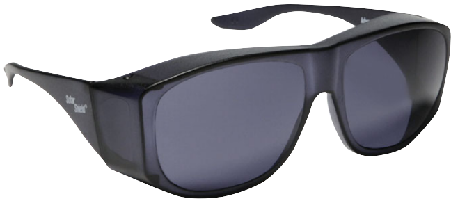
ITEM #00657 SolarShield®