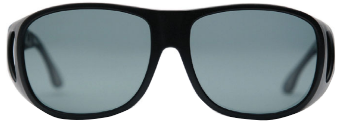
ITEM #00747 OverRxCast

Shielding your eyes from destructive ultraviolet sun rays is one of the most effective means of protecting against ocular disease.