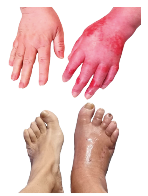
FIGURE 3. Images of CRPS with involvement of the hand and the foot. The clearly intense inflammatory profile is evident in the early stages