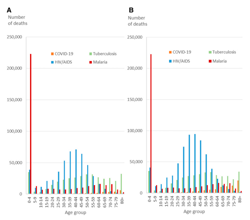
FIGURE 2. Mortality predicted for the 12 months of 2020 for malaria, tuberculosis, and HIV/AIDs (impact before lockdown) and until March 31, 2021, for COVID-19 in sub-Saharan Africa. (A) Mortality for sub-Saharan countries north of South Africa and Lesotho. (B) Mortality for all sub-Saharan countries. This figure appears in color at www.aitmh.org.

explained by higher reporting rates, South Africa also has higher rates of known mortality risk factors. <sup>40</sup> Evidence of very high asymptomatic infection<sup>39</sup> and the level of testing occurring (868,823 tests for 333 deaths in Uganda alone by February 23, 2021)<sup>41</sup> suggest that the relatively low recorded mortality in most countries reflects reality similar to that in much of Asia. <sup>42</sup>