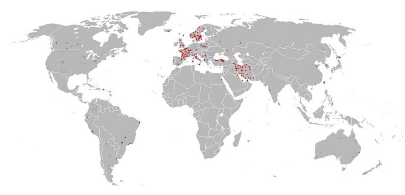
Figure 2 Global distribution of prevalence points in analysis. Those in blue are the prevalence points from the original 2010 study, while those in red are the new prevalence points in the current study.

in other global regions, however, as there was insufficient allele frequency data (data not shown).