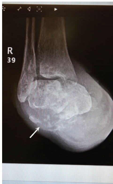
Figure 3. X-RAY OF AFFECTED LIMB

The affected limb is 12° warmer than the contralateral limb with bone destruction clearly visible at the arrow. X-ray used with patient permission.