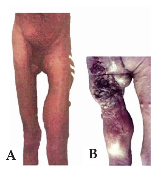
FIGURE 9: A. Neurofibrosarcoma or malignant schwannoma in the buttock and left leg. B. Neurofibrosarcoma or malignant schwannoma compromising the buttock and left leg (dorsal view)

Shortly after, Carey et al. (1986) proposed that NF be classified into only five types, based on distinct clinical features and genetic implications for the