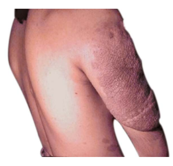
FIGURE 7: Plexiform neurofibroma - Dermatology Service, FAMERP

Gordon (1966) observed that macrocrania and macrocephaly occurred in most children with NF.<sup>129</sup> CT scans were normal, suggesting an increased size of the brain proportional to the size of the skull.<sup>130</sup> Low stature occurs due to changes in development (growth impairment) and bone structures. Scoliosis is