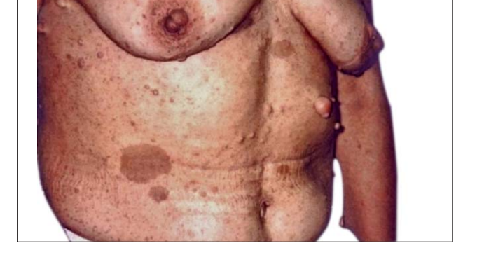
FIGURE 1: Café au lait spots and neurofibromas typical of NF patients at Centro de Pesquisa e Atendimento em Neurofibromatose (CEPAN) - Faculdade de Medicina de São José do Rio Preto (FAMERP)

Another type of hyperpigmented spot occurs over the entire length of plexiform neurofibromas, which have a darker color than that of café au lait spots.<sup>125</sup>