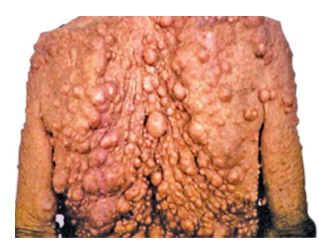
FIGURE 5: Neurofibromas of various sizes in a widespread distribution - Dermatology Service, FAMERP

Disseminated neurofibromas and a giant plexiform in the sacral region covering the buttocks -Dermatology Service, FAMERP