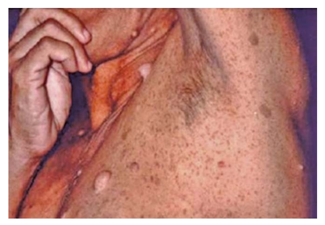
FIGURE 3: Café au lait spots, axillary freckling and neurofibromas

Solitary or multiple neurofibromas are dysplastic tumors formed by axonal processes, Schwann cells, fibroblasts, perineural cells and mast cells.<sup>126</sup> They have a soft texture, can be semiglobulus or pedunculated, are violet or skin colored and vary in number – they can be scarce and unique or cover the entire body - and size - from punctiform to masses of 5 or more cm in diameter (Figures 4 and 5).They are usually asymptomatic, but they can be itchy, painful and sensitive to touch.<sup>121</sup>