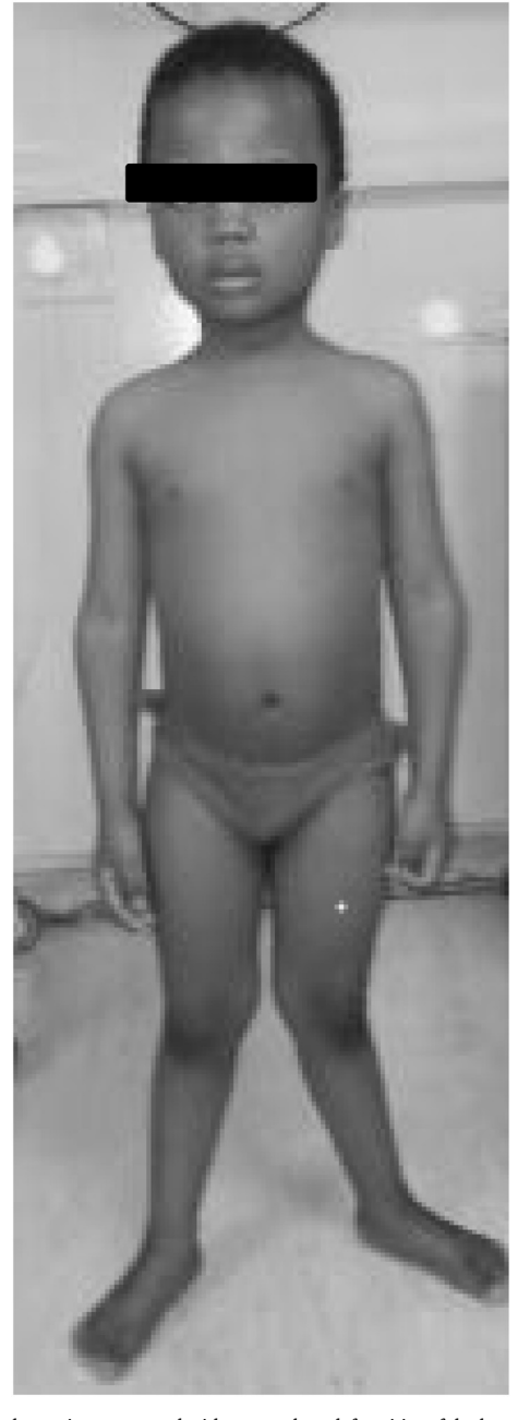
Fig. 1. The index patient presented with genu valgus deformities of the lower limbs at the age of 4 years.

Nutritional rickets remains a global public health concern, particularly in a number of lower–middle income countries (LMIC) and among at-risk immigrant communities in resource rich countries, as has been highlighted by a recent international consensus statement (Munns et al., 2016), despite a greater understanding of the etiology and pathogenesis of the condition. Vitamin D deficiency has generally been considered to be the primary cause of nutritional rickets, however more recent research into dietary calcium deficiency has now provided clinicians with reasons to investigate and manage patients with nutritional rickets differently. Although vitamin D deficiency is probably the commonest cause of nutritional rickets globally, dietary calcium deficiency has been identified as a common cause of nutritional rickets in a number of developing countries (Pettifor, 2014).