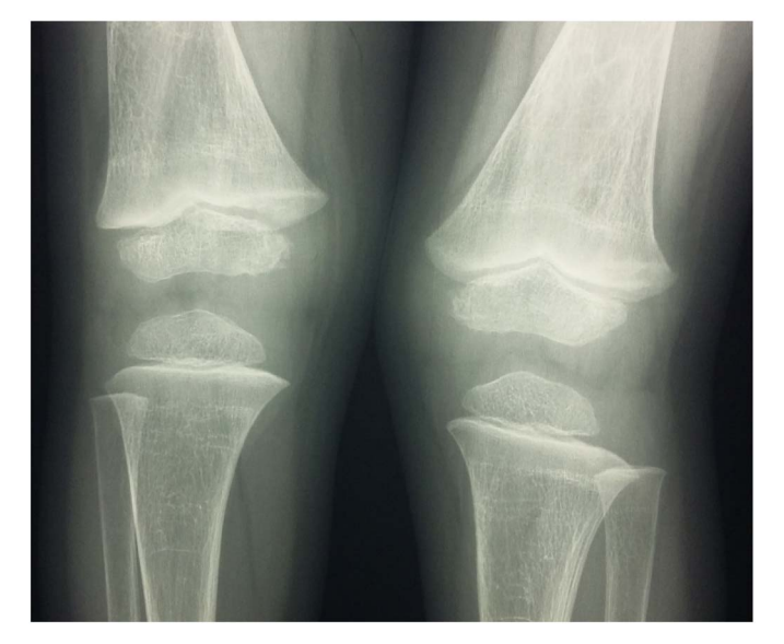
Fig. 3. Radiological findings at the knees showing slight increased width of the growth plate at distal ends of right and left femurs.