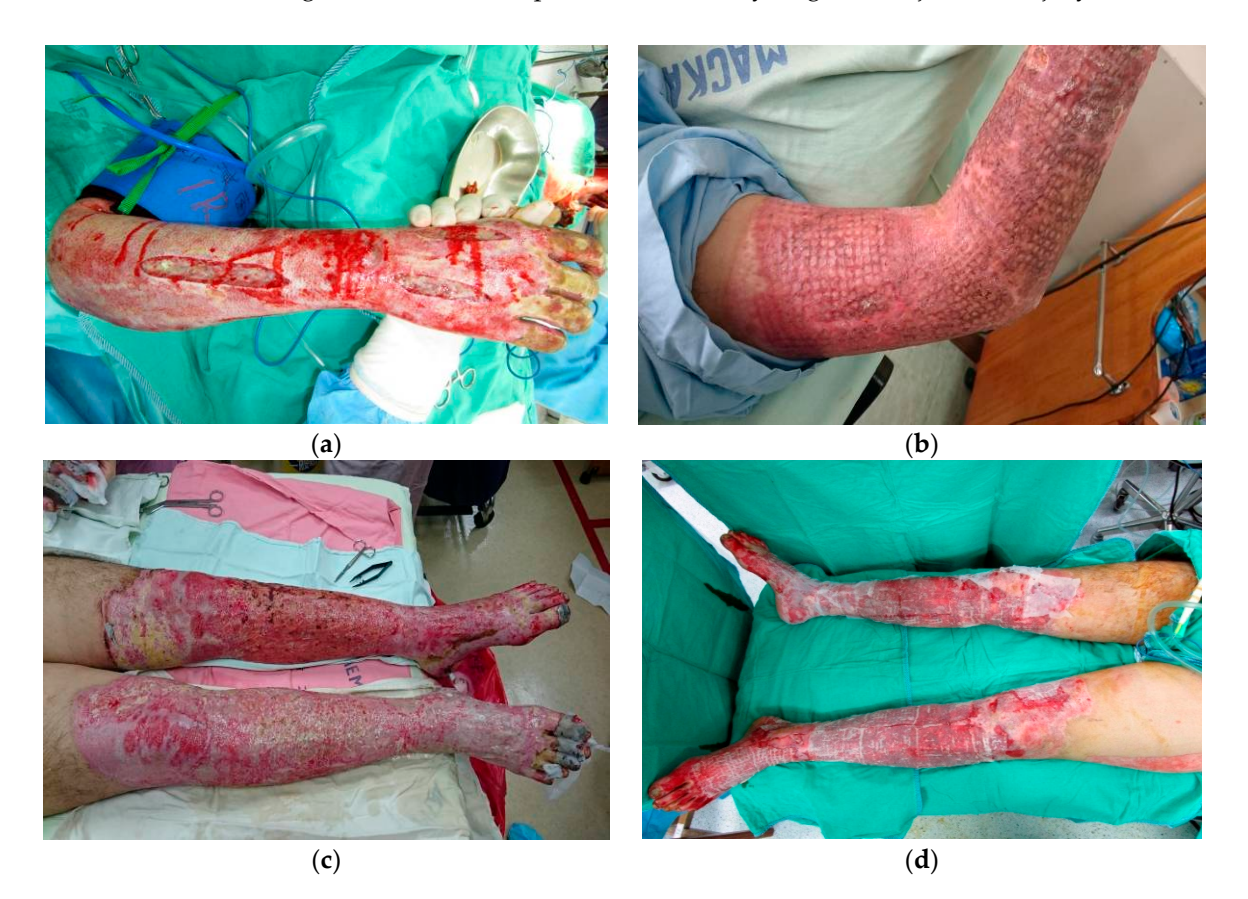
Figure 1. (a) Severe burn of the right hand, after escharotomy; (b) burn injury of the upper limb, status post-skin graft; (c) severe burn of the lower limbs with local necrosis; (d) burn injury of the lower limbs, after wound dressing.