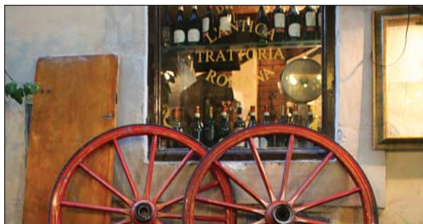
Wheels in front of window in Rome, Italy.