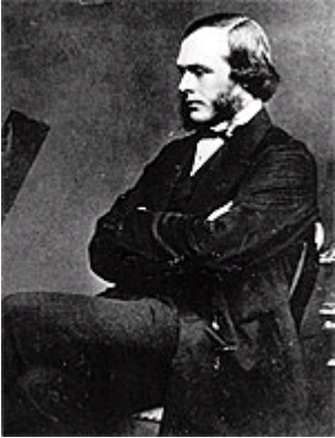
Joseph Lister, British surgeon who discovered antiseptics.

It is hard to imagine, but it was not until 1867 that Joseph Lister published his findings about the critical need of using sterile procedures in the surgical setting. Back then, doctors seldom washed their hands prior to surgery, let alone sterilize the instruments they had used on the previous patient.